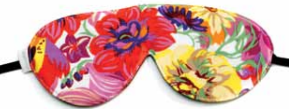
"Bouquet" sleep mask lets you get your beauty rest by delicately shading eyes, 100 percent silk, at Elizabeth W, $22