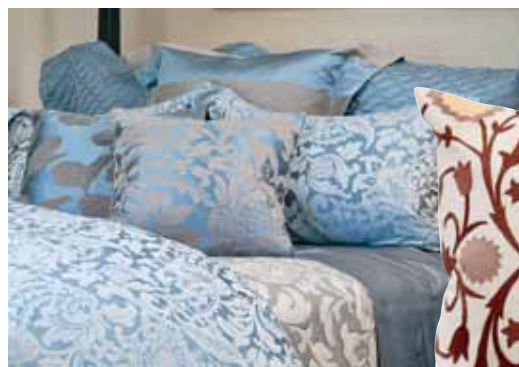
"Venice Silk" bedding by SDH, silk and Egyptian cotton, at Misto Lino, price varies by item