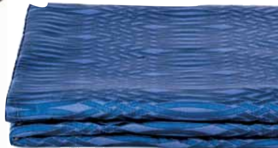
Richly textured Italian-made "Luxury Link" throw, made of acetate, cotton and polyamide, with 100 percent Egyptian cotton sateen bottom side; shown in blue/night, at Frette, $1,800