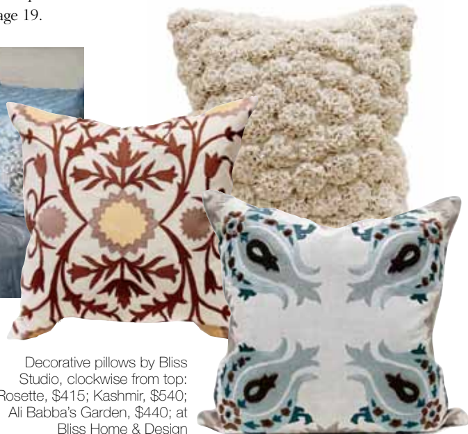
Decorative pillows by Bliss Studio, clockwise from top: Rosette, $415; Kashmir, $540; Ali Babba's Garden, $440; at Bliss Home & Design